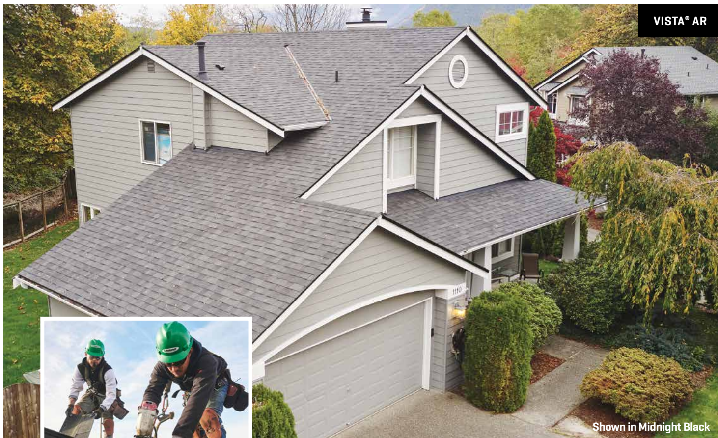
Shown in Midnight Black